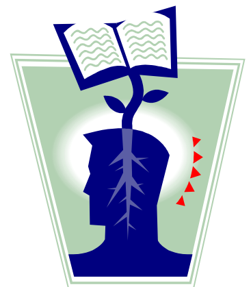
knowledge common abstract