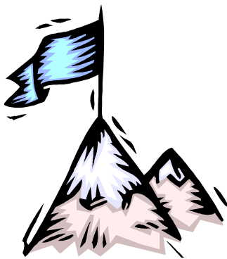
Mount Everest proper concrete